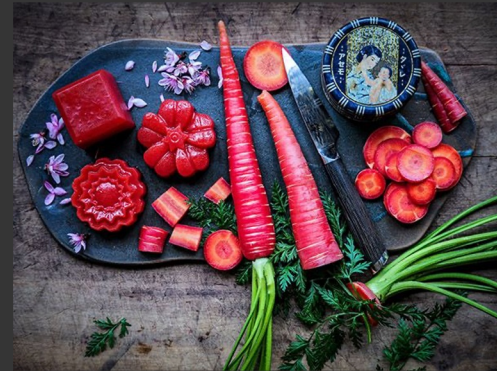
Kyoto Red carrot