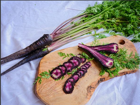
Pusa Asita Black carrot

We focus on planting heirloom seeds that represent a wide diversity of food cultures.