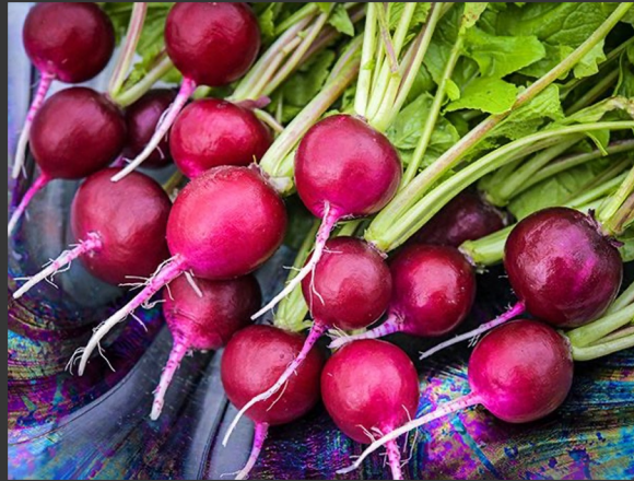
Malaga Polish radish